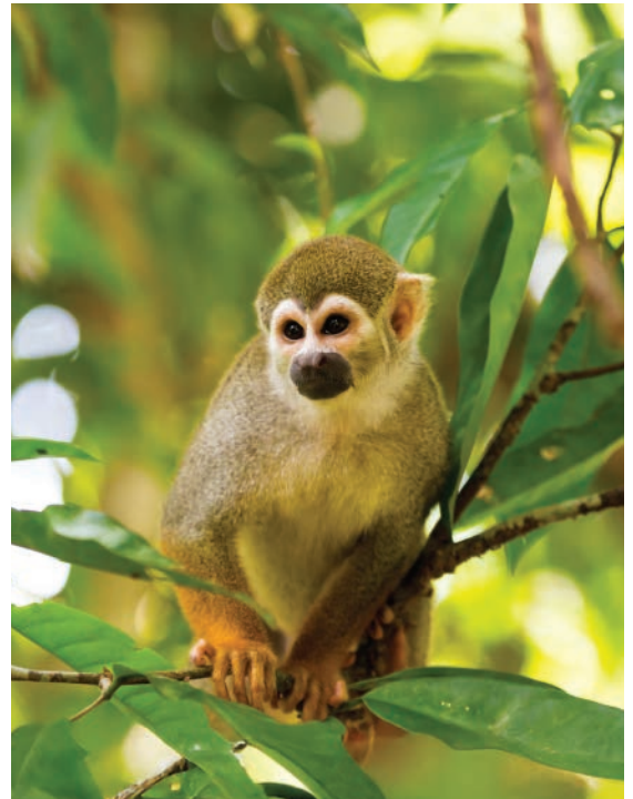
SAIMIRIS (SQUIRREL MONKEYS)