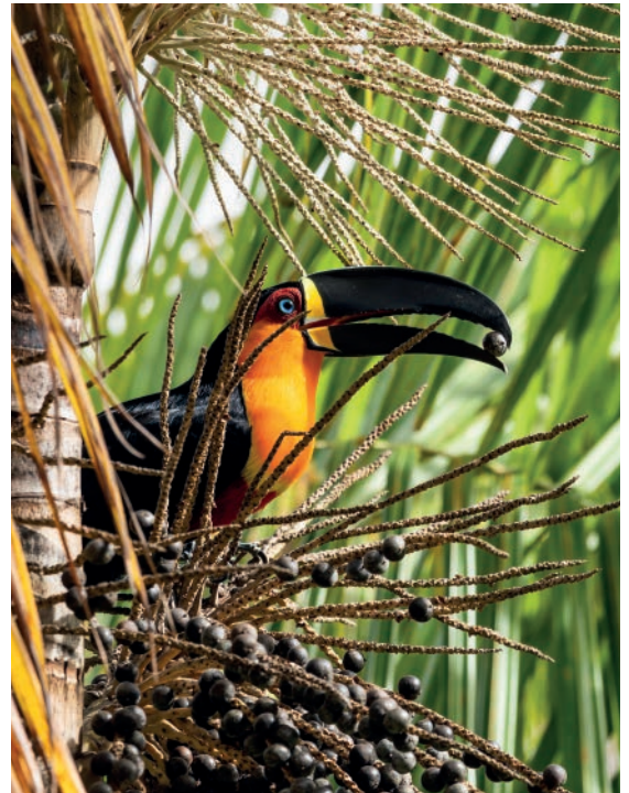
TOUCAN, AÇAÍ BERRIES